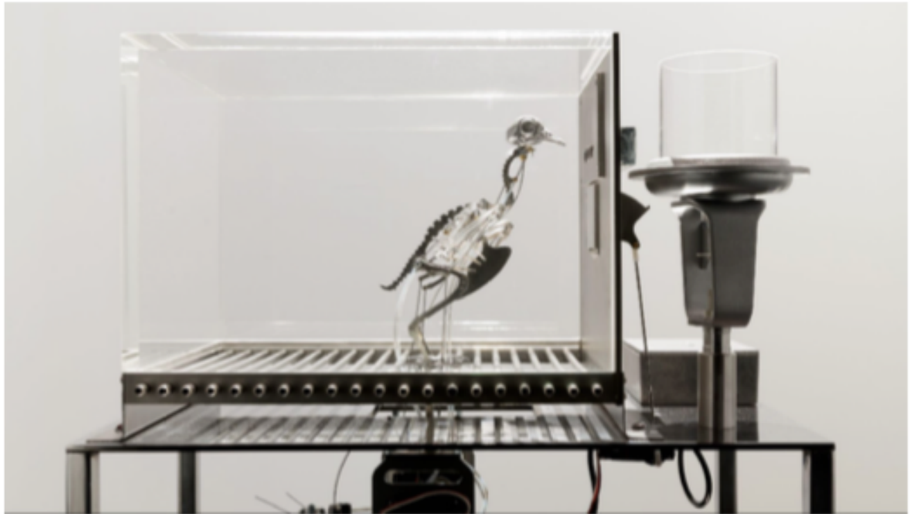
Mat Collishaw, The Machine Zone, Aluminium, Steel, Resin, Servo Motors, Motion Sensors, Electrical Circuitry. Dimensions Variable, 2019

Bomb Factory Art Foundation is pleased to present All Things Fall , a solo exhibition featuring the work of contemporary British artist Mat Collishaw, from April 20th, 2023, to May 21st, 2023. The exhibit will be held at BFAF's newest studio in Marylebone.